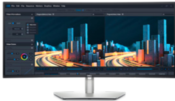
Dell UltraSharp 34 Curved USB-C HUB Monitor - U3421WE

An immersive 34" WQHD curved monitor with wide color coverage and extensive connectivity including RJ45, USB-C® and quick-access front ports.