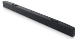
Dell Slim Soundbar - SB521A

An immersive 34" WQHD curved monitor with wide color coverage and extensive connectivity including RJ45, USB-C® and quick-access front ports.