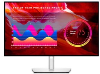
Dell UltraSharp 27 Monitor - U2722D

World's slimmest and lightest soundbar offers exceptional audio clarity and easy magnetic attachment to your Dell monitors, ensuring a clutter-free desk.